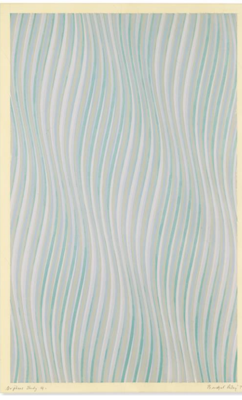
Bridget Riley, Orpheus Study 14 (1978, estimate: £80,000-120,000)