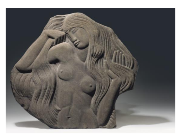
Eric Gill, Nude Girl with Hair (1925, estimate: £300,000-500,000)

Mother and Child: Crossed Feet (1956, estimate: £150,000-250,000) shows a mother who holds her arm at a stiff right angle, emphasising the role of mother as the powerful protector, while the child appears enveloped in her tender yet forceful hold. Carved in 1925, Eric Gill's Nude Girl with Hair (1925, estimate: £300,000-500,000, illustrated, right ), property of the Meynell Family, was conceived while Gill and his family stayed in Capel-y-ffin, a remote village in the Black Mountains, on the border between England and Wales. It was here that Gill began to carve in stone, enjoying the directness of the method, where there was no intermediary between the concept and the final outcome. Another highlight, Nijinski Hare , (1986, estimate: £600,000-800,000) is one of Barry Flanagan's most iconic and monumental sculptures, which typifies the sense of wit, humour and playfulness, he imbued on his figures.