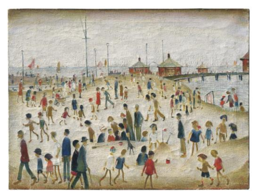
L.S Lowry, Lytham Pier (1945, estimate: £700,000-1,000,000)

Lytham Pier (illustrated, left) depicts the bustling beach-scene common to British life during the 1940s while Church Street, Clitheroe (1964, estimate: £250,000-350,000) is a strong example of L.S. Lowry's shift in subject matter from bustling street scenes with towering industrial buildings on the horizon, to paintings of individuals and small groups with little surrounding detail. In Procession in South Wales, Whit Monday, 1963 (estimate: £300,000-500,000), Lowry further develops the theme of people walking across an entirely open landscape. The Rent Collector (1922, estimate: £40,000-60,000) illustrates a scene that